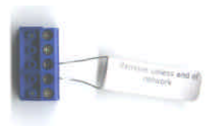
Figure 2: Termination Resistor

This resistor is 120 Ohms, 0.25 Watt and is connected between the CAN-H and CAN-L terminals.